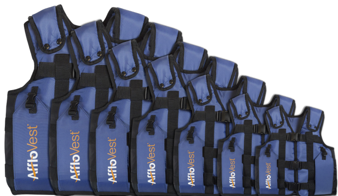
Patents Pending – USA & Worldwide